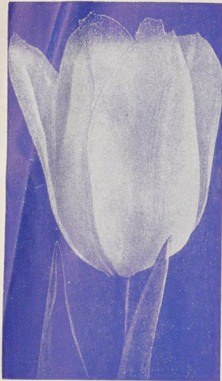
OLYMPIADE. Single Early Tulip

Cottage Tulips are rich in the more delicate and artistic colors missing in other late tulips. The single, graceful flowers differ in form being mostly long and oval-shaped. Stems are long and not so stiff as Darwins.